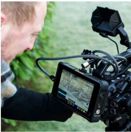
Operating the EVA1 outside

The ability to capture accurate colours and rich skin tones, is a must for any filmmaker. Much like the VariCam line-up of cinema camera, the EVA1 contains V-Log/V-Gamut colour science, and is able to capture and deliver both high dynamic range and a broad colour pallet.