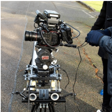
The EVA1 rigged up for filming