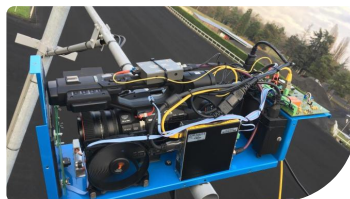
An AG-UX180 camera at the Hippodrome de Vincennes