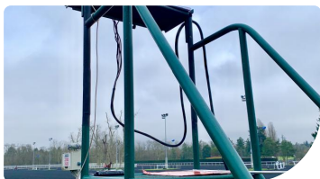
Stand for checking false starts

“We've been able to appreciate the technical prowess of the Panasonic cameras and we're extremely confident that the cameras will be highly effective over the long term in view of our previous experience with Panasonic. We have no doubt about the results to come”, concludes Stéphane Deuil.