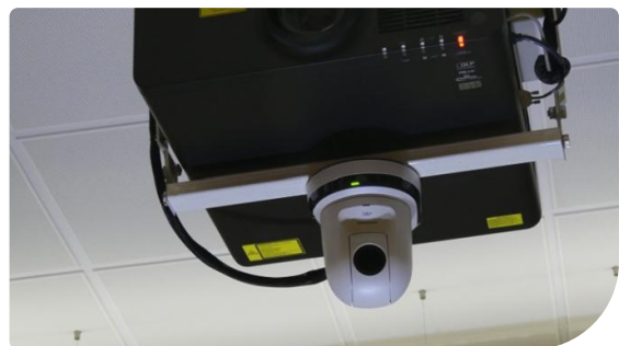
Projection and remote cameras combine at Edge Hill University