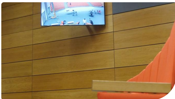
Repeater monitors at Edge Hill University

The three lecture theatres can also be combined into a single 900 seat auditorium which is used for large events, including the University's graduation ceremony.